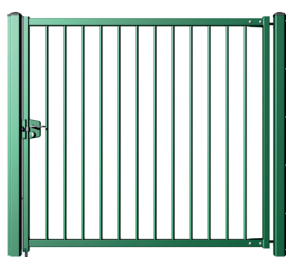
G gate with standard bars