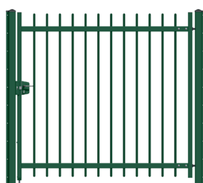
G gate Traversa